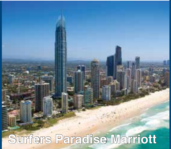
Surfers Paradise Marriott